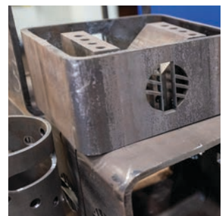
Capable of cutting simple holes to intricate patterns and designs