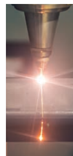
Precise cuts to your specs